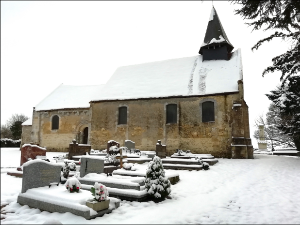
Chapelle de Saint-Maclou - January 2024

In this first month of the year, as everywhere else, snow has blanketed our chapel in its winter veil. For a fleeting moment, aided by a cold snap, it has flooded our landscape and whitened our orchard. Its icy air creates an ephemeral nature that delights our eyes, but should not make us forget, in these times, those who cannot find refuge by a fireplace and who often have no shelter other than a simple cardboard box.